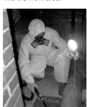
Cleaning up dust prior to starting work.