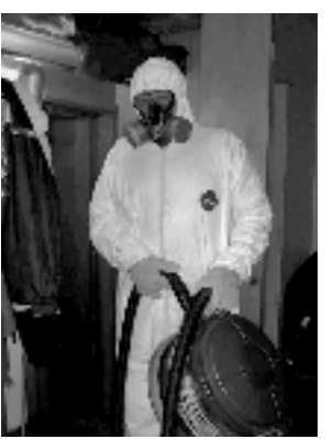
Who ya gonna call – "Dust Busters!