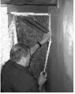
Sealing off the work area.

their exposure to dust and soil created by work projects, and by minimizing pregnant women's exposure as well. Others in the community are usually not at risk, even when exposed to work projects. However, short-term exposure to very high dust levels that can be encountered depending on project conditions and practices could result in elevated blood lead levels in adult workers or residents.